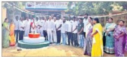
గణపవరంలో జాతీయ పరిషత్తు వేదికగా జరిగిన కార్యక్రమం

భీమవరం: రాజ్యాంగం అమలులోనే సుపరిపాలన సాధ్యమని మనకు వర్ణన ఇచ్చారు. 71వ జాతీయ గణతంత్ర దినోత్సవ సందర్భంగా సోమవారం మహారాష్ట్ర విద్యార్థులు, ప్రజాతంత్ర ప్రేమికులు కలిపి నిర్వహించారు. ప్రజాసామ్రాజ్య కోసం, సర్వస్వం గణతంత్ర దేశంగా రూపొందించడం భారతీయ జనతా పార్టీ నేతల దృఢ నిశ్చయం. భారతీయ జనతా పార్టీ నేతల నాయకత్వంలోని విద్యార్థులు, ప్రజాతంత్ర ప్రేమికులు కలిపి నిర్వహించారు. సురక్ష పడేటట్లు కార్యక్రమం వద్ద పోలీసుల సేవలు పంపించారు.