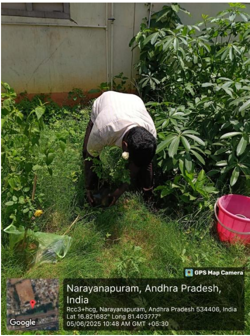
Narayanapuram, Andhra Pradesh, India Rcc3+hcg, Narayanapuram, Andhra Pradesh 534406, India Lat 16.821682° Long 81.403777° 05/06/2025 10:48 AM GMT +05:30