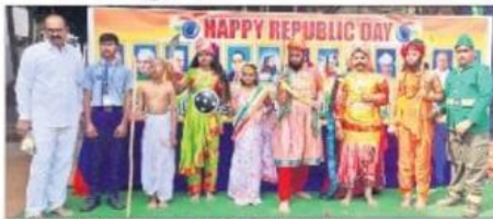
భీమవరం: అభ్యుదయ కార్యకర్తల సంఘం వేదికగా జరిగిన కార్యక్రమం