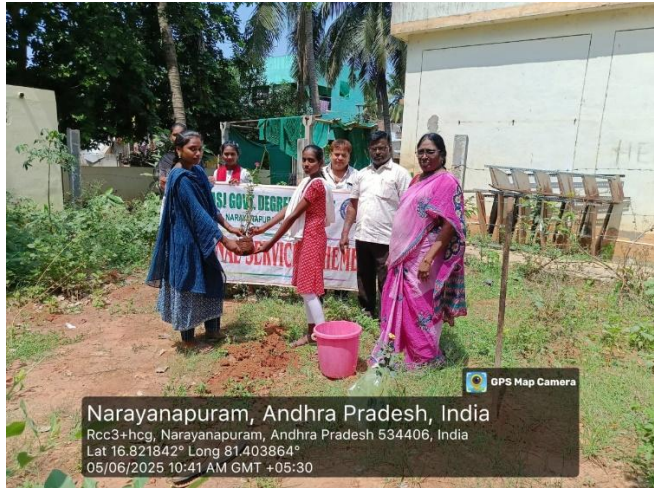
Narayanapuram, Andhra Pradesh, India Rcc3+hcg, Narayanapuram, Andhra Pradesh 534406, India Lat 16.821842° Long 81.403864° 05/06/2025 10:41 AM GMT +05:30