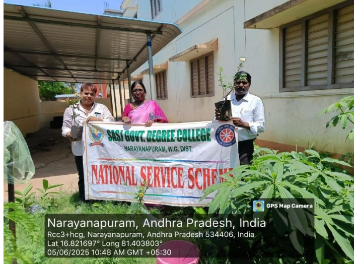
Narayanapuram, Andhra Pradesh, India Rcc3+hcg, Narayanapuram, Andhra Pradesh 534406, India Lat 16.821697° Long 81.403803° 05/06/2025 10:48 AM GMT +05:30