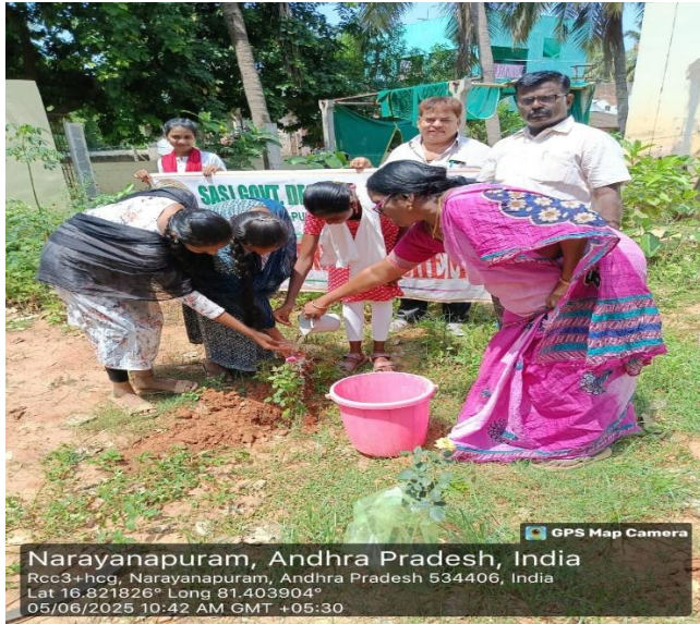
Narayanapuram, Andhra Pradesh, India Rcc3+hcg, Narayanapuram, Andhra Pradesh 534406, India Lat 16.821826° Long 81.403904° 05/06/2025 10:42 AM GMT +05:30