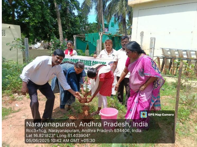
Narayanapuram, Andhra Pradesh, India Rcc3+hcg, Narayanapuram, Andhra Pradesh 534406, India Lat 16.821823° Long 81.403904° 05/06/2025 10:42 AM GMT +05:30