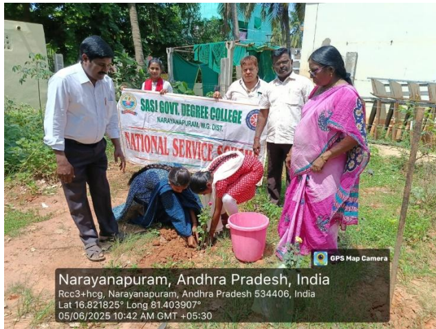
Narayanapuram, Andhra Pradesh, India Rcc3+hcg, Narayanapuram, Andhra Pradesh 534406, India Lat 16.821825° Long 81.403907° 05/06/2025 10:42 AM GMT +05:30